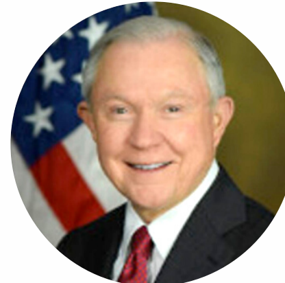
JEFF SESSIONS FMR. U.S. ATTORNEY GENERAL