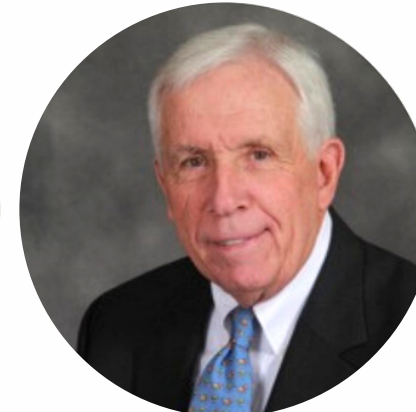
FRANK WOLF FMR. U.S. CONGRESSMAN