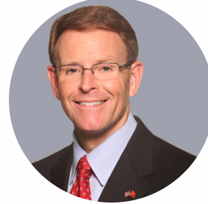
TONY PERKINS PRESIDENT, FAMILY RESEARCH COUNCIL