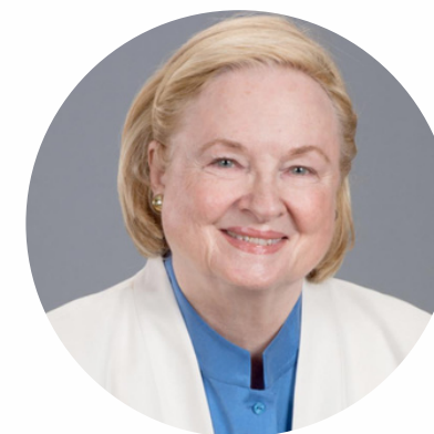
MARY ANN GLENDON FMR. U.S. AMBASSADOR