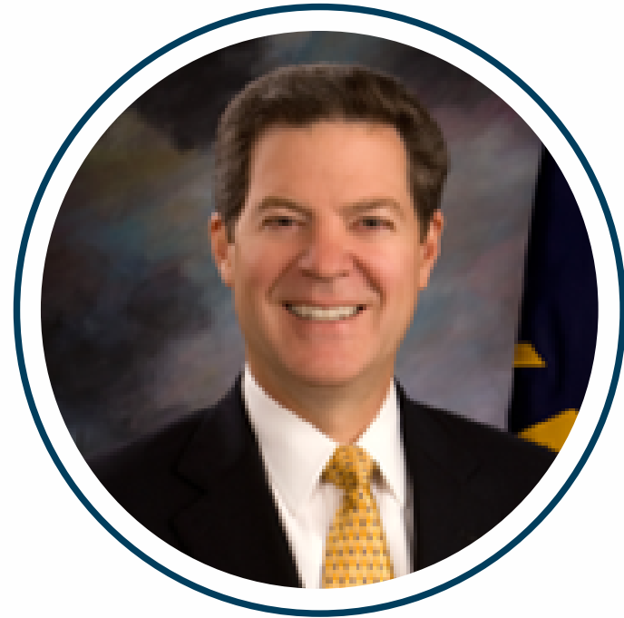
Amb. Sam Brownback