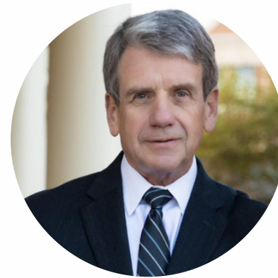
MICHAEL FARRIS PRESIDENT, ALLIANCE DEFENDING FREEDOM