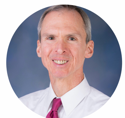
DANIEL LAPINSKI FMR. U.S. CONGRESSMAN