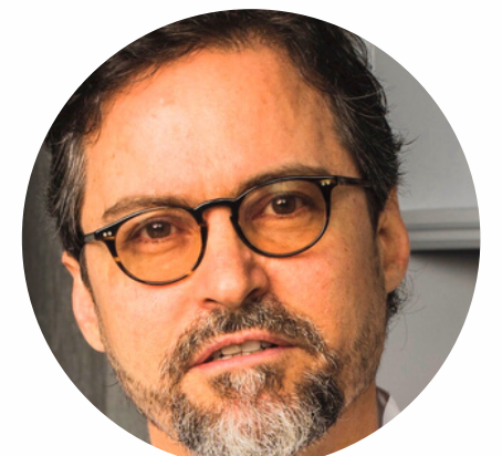
SHEYKH HAMZA YUSUF PRESIDENT, ZAYTUNA COLLEGE