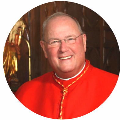
CARDINAL TIMOTHY DOLAN ARCHBISHOP OF NEW YORK